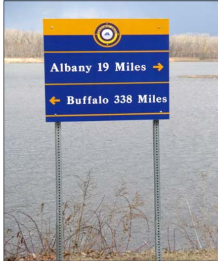
A new sign at Lions Park in Niskayuna shows the distances to the two ends of the Canalway Trail system.

• Schenectady County received a $145,000 federal Spot Improvement Program grant. Of that, $17,600 will go to build information kiosks and trail markers along the Mohawk-Hudson Bike-Hike Trail, with the county providing $4,400 of the cost. The markers will be located on city streets from Washington Avenue to Jay Street, where there is a gap in the off-road section of trail, and at Nott Street,